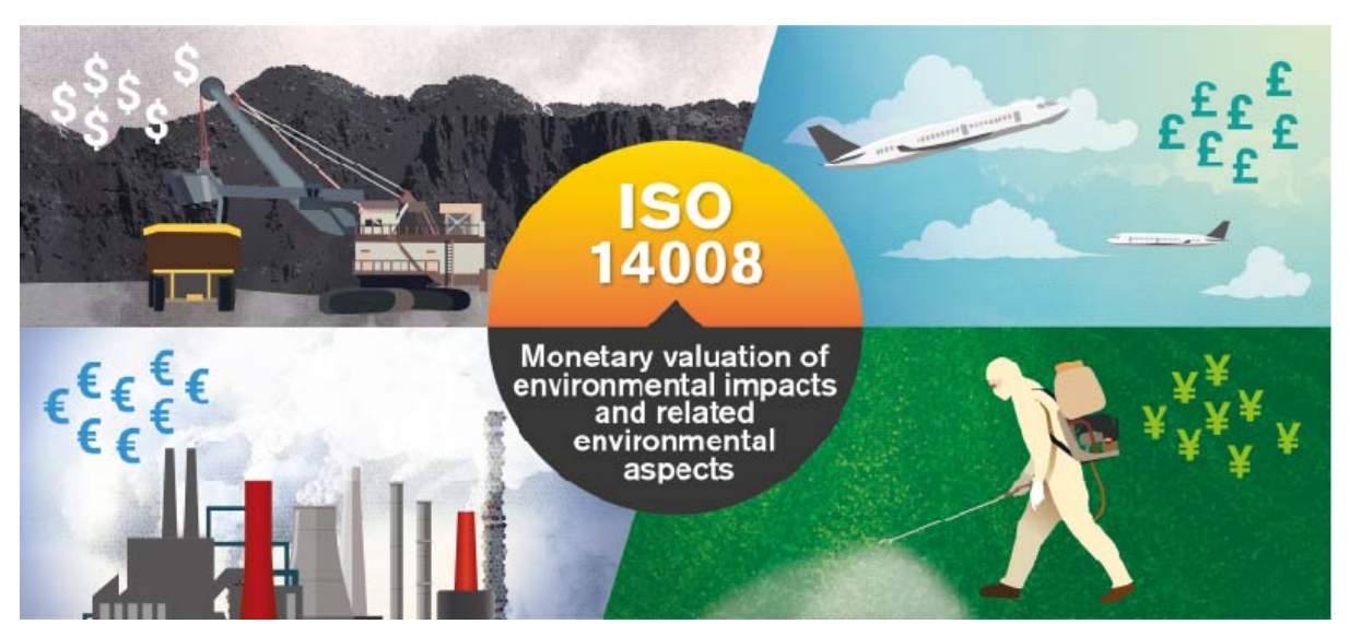
Coal mining, air transport, fossil power plant operation and agricultural pesticide use are examples of activities where the new ISO-standard can help to valuate the resultant environmental damage in monetary terms. Illustration by Yen Strandqvist.